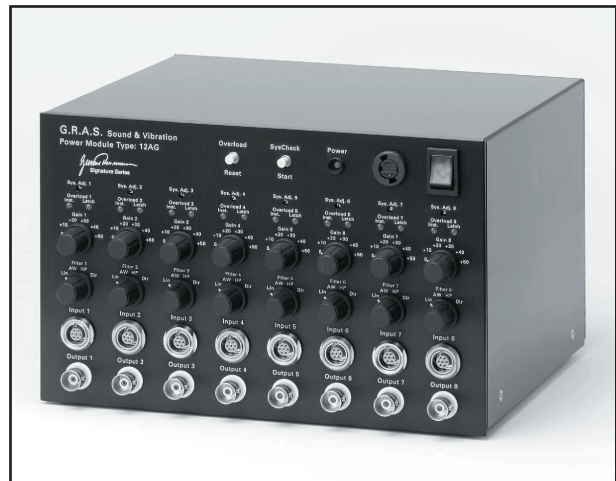
Fig. 1 8-channel Power Module Type 12AG

The input to each channel is a 7-pin LEMO socket